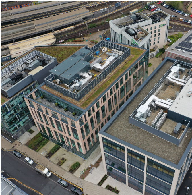
Two & Three Stockport Exchange (centre & right)