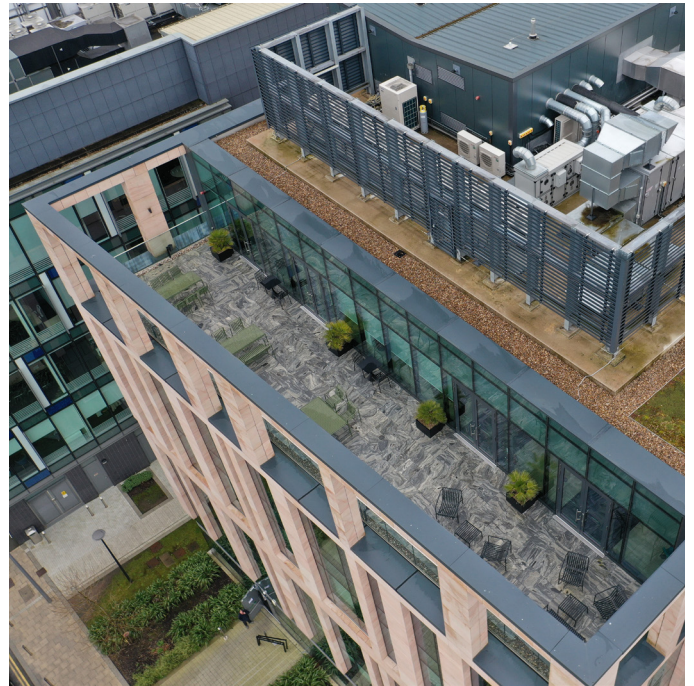
Two Stockport Exchange

As with most new build projects, early engagement and working in complete transparency is fundamental to ensure